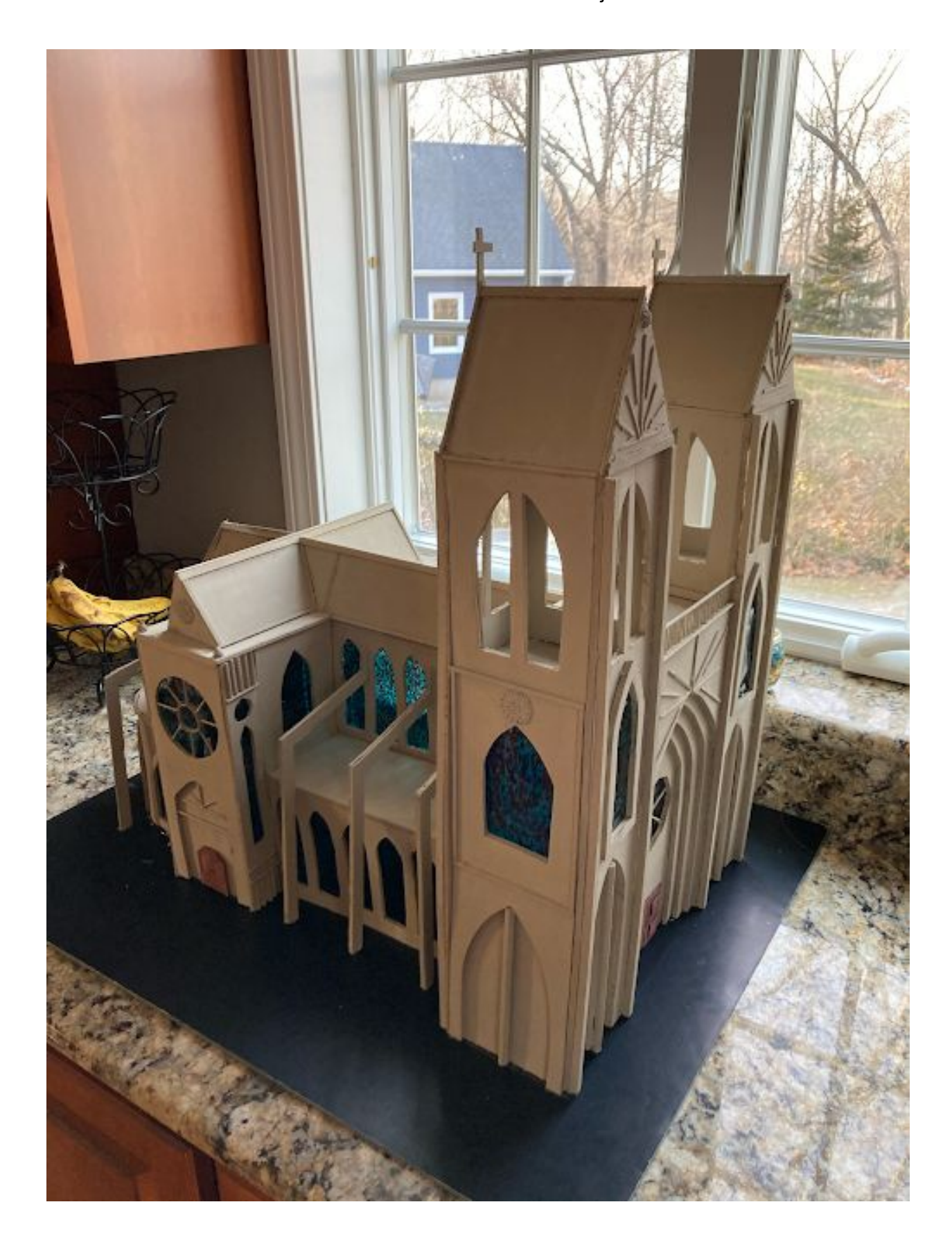
Grace Pendleton - Gothic Cathedral Architecture Project - Humanities Honors