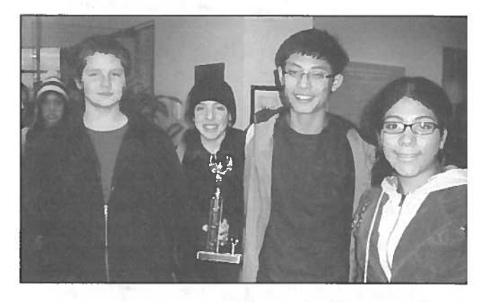
Glastonbury High School's team took home their third place trophy