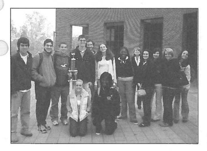
Windsor High School students proudly stand with their first place trophy. Congrats Windsor!

Windsor High School left the UConn Storrs Campus on November 8th as the proud winners of this year's UConn ECE French Quiz Bowl. Approximately 130 students from Coventry High School, E.O Smith High School, Enrico Fermi High School, Fairfield Warde High School, Glastonbury High School, Southington High School and Windsor High School enjoyed a full day of French activities. Shelton High School, new to UConn ECE, joined in the festivities as the eighth participating school at the quiz bowl.